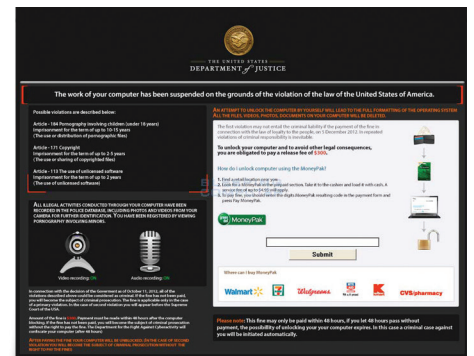
Screenshots taken from computers infected with Ransomware